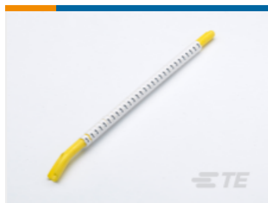
TE Part # CAT-T3437-ST2999 STD Snap-On Markers